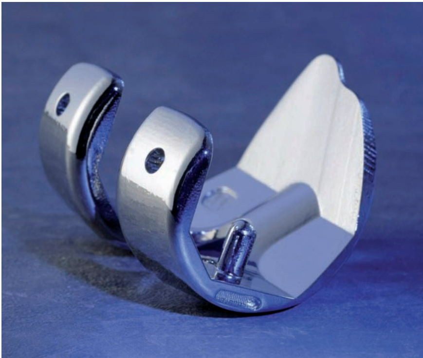
The medical sector is one of the lead examples for direct part production from metal powder