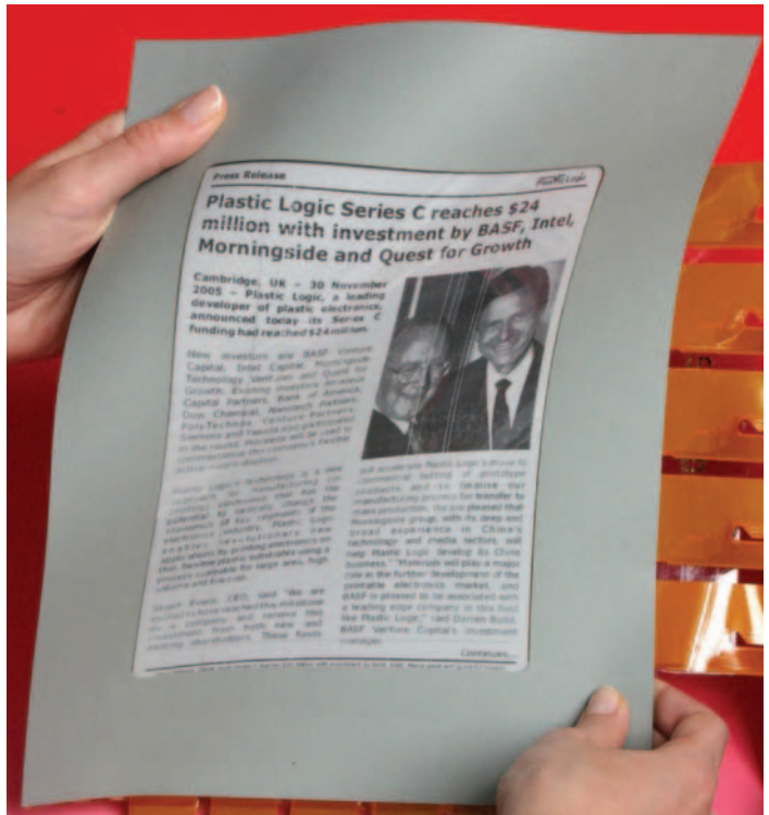
Plastic Logic is just one company developing flexible display technology

Potential applications for plastic electronics seem to be widespread. What sectors does Lord Mandelson think UK companies should target? "The largest growth in plastic electronics is predicted to take place in the markets for display screens, lighting and solar cells. We have strengths in each of these areas and UK companies are already exploiting early opportunities."