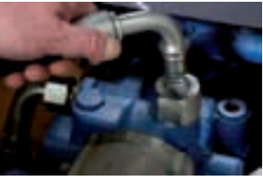
Above: Gates' Quick-Lok connectors Below: Chesteron's breakthrough ram seals in operation