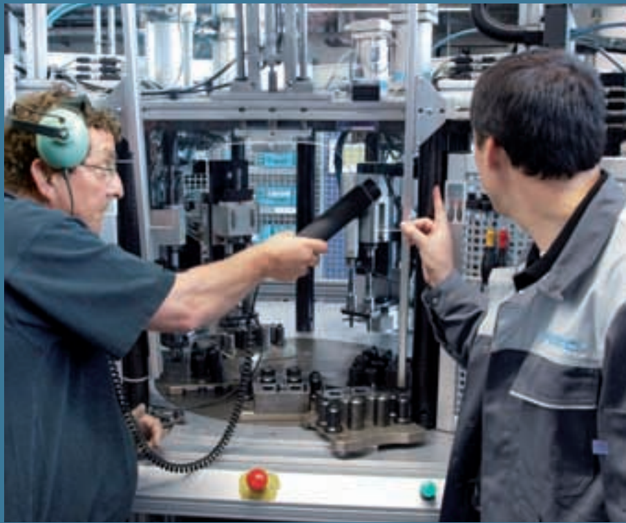
Left: Wimbledon's sliding roof – engineers didn't risk hydraulics Right: Festo's air leak analysis service can save thousands of pounds