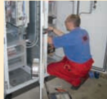
ABB and Danfoss are among leaders bringing out low harmonic drives that eliminate the problem.

Making that work with VSDs turned out not to be difficult. In operation, the first drive now receives feedback from an encoder on the line shaft and this setpoint is then cascaded from one drive to the next. Each drive then controls the speed of a 37kW ABB high efficiency ac motor, in sync with the overall machine line shaft. In a conventional setup, a PLC would have managed each of the three sections independently, each driven by a dc drive. But with the control capabilities of these drives, that wasn't necessary. “All functions for sectional speed control and communications are within each drive, which means that a controlling PLC is not required,” confirms Domville.