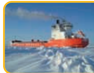
Sub-sea Azipod drives are enabling revolutionary icebreaker designs

Altogether no mean feat and, plainly, the technology behind not just the Azipods – their drives, motors, sealing technology etc – but their assembly operations, is a tribute to multi-disciplinary engineering. Next time you book your holiday on board a Royal Caribbean Cruise Lines ship, ask to see the engine room. FE