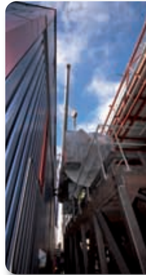
Above: construction work at Kingston Hospital, with its Dalkia-managed CHP Left: Another Dalkia CHP installation – this also based at Kingston