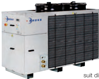
Getting plant efficiency right starts with selecting the right technology for the application

Bailey. "For example, for each litre of heavy fuel oil burned unnecessarily to compensate for a steam leak, approximately 3kg of CO 2 is emitted to atmosphere."