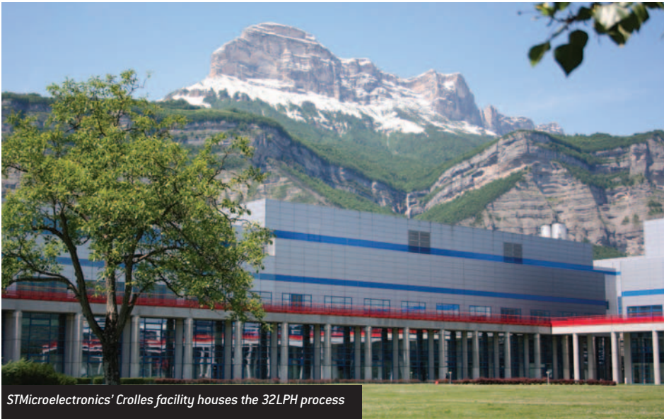
STMicroelectronics' Crolles facility houses the 32LPH process

option. We will now be able to make the complete design in Crolles." Magarshack also noted the central R&D group had developed a high speed clocking methodology that allowed clocks for 12Gbit data transfer to be placed and routed.