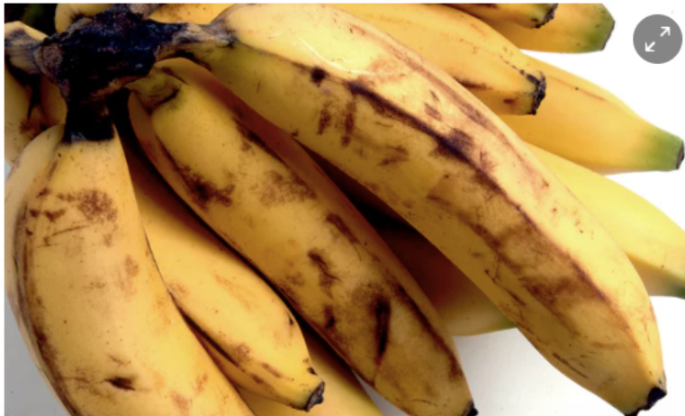
Sainsbury's supermarket is trying to encourage customers to use fruit that is past its best in recipes such as

Government study says £80m worth is discarded every year - sometimes simply because of a minor bruise or black mark