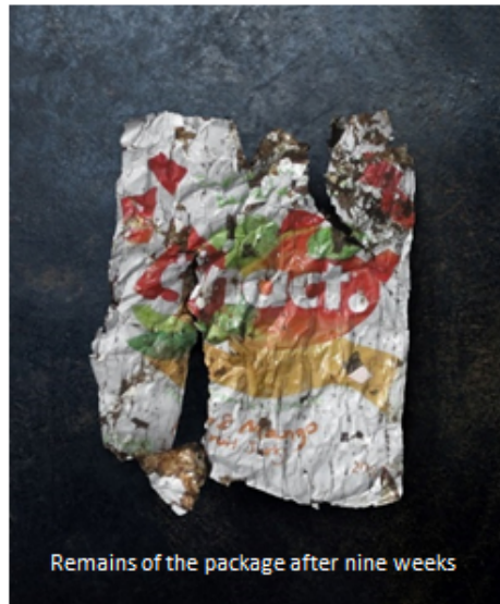
Remains of the package after nine weeks