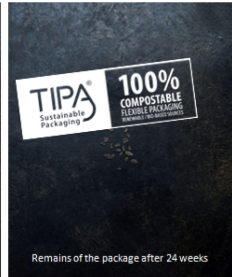
Remains of the package after 24 weeks